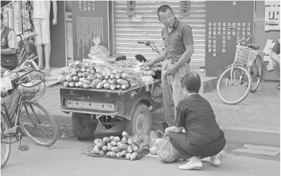
A Chinese man selling fresh produce on a street in Hohhot, Inner Mongolia.

Mongolians have traditionally been nomadic herders, but both freedom from the Soviet Union and the more recent discovery of large deposits of coal, copper, and gold have both boosted the economy and drawn more people into urban environments. Still, about half the population is nomadic.